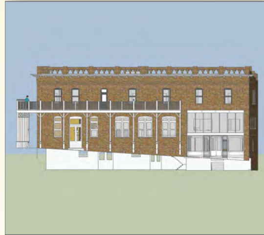
Third street future view of Hotel Lincoln restoration