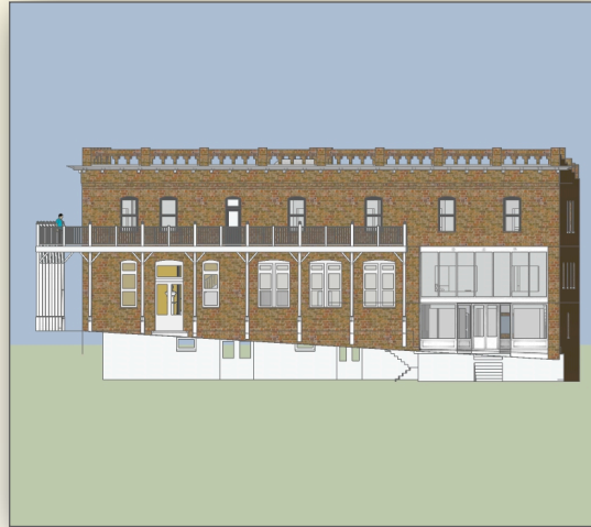
Third street future view of Hotel Lincoln restoration

To sponsor an entire window, the minimum donation is $850.